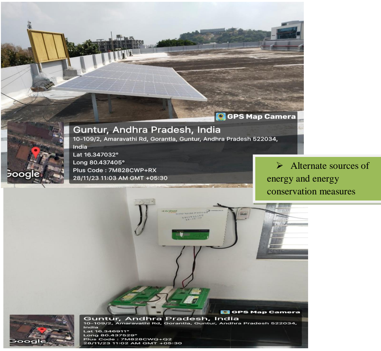
Solar roof top solar panel-1 kv